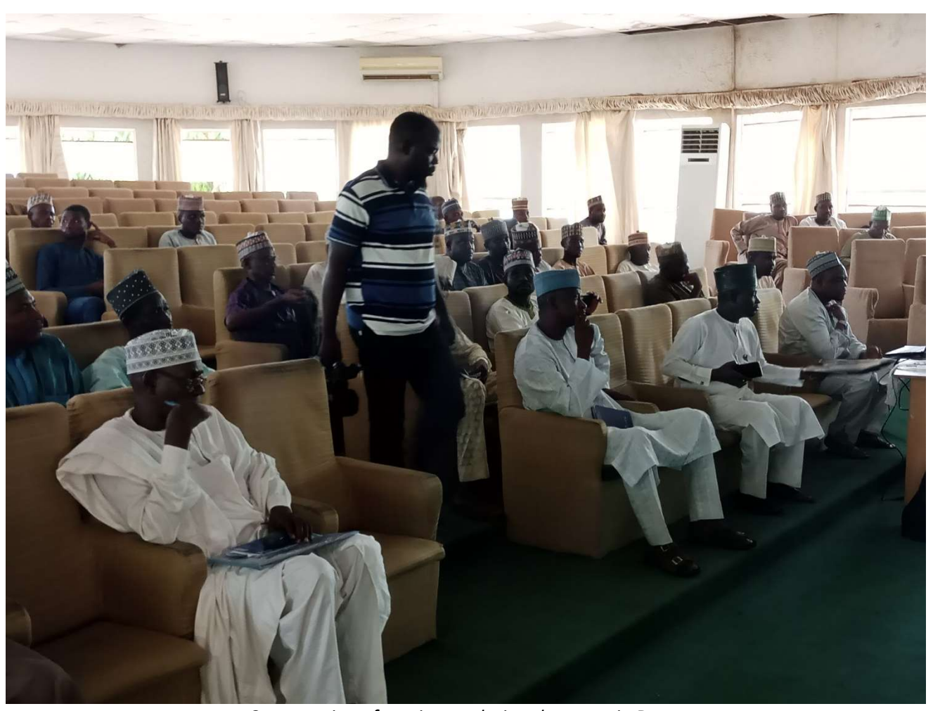
Cross section of partipants during the event in Dutse