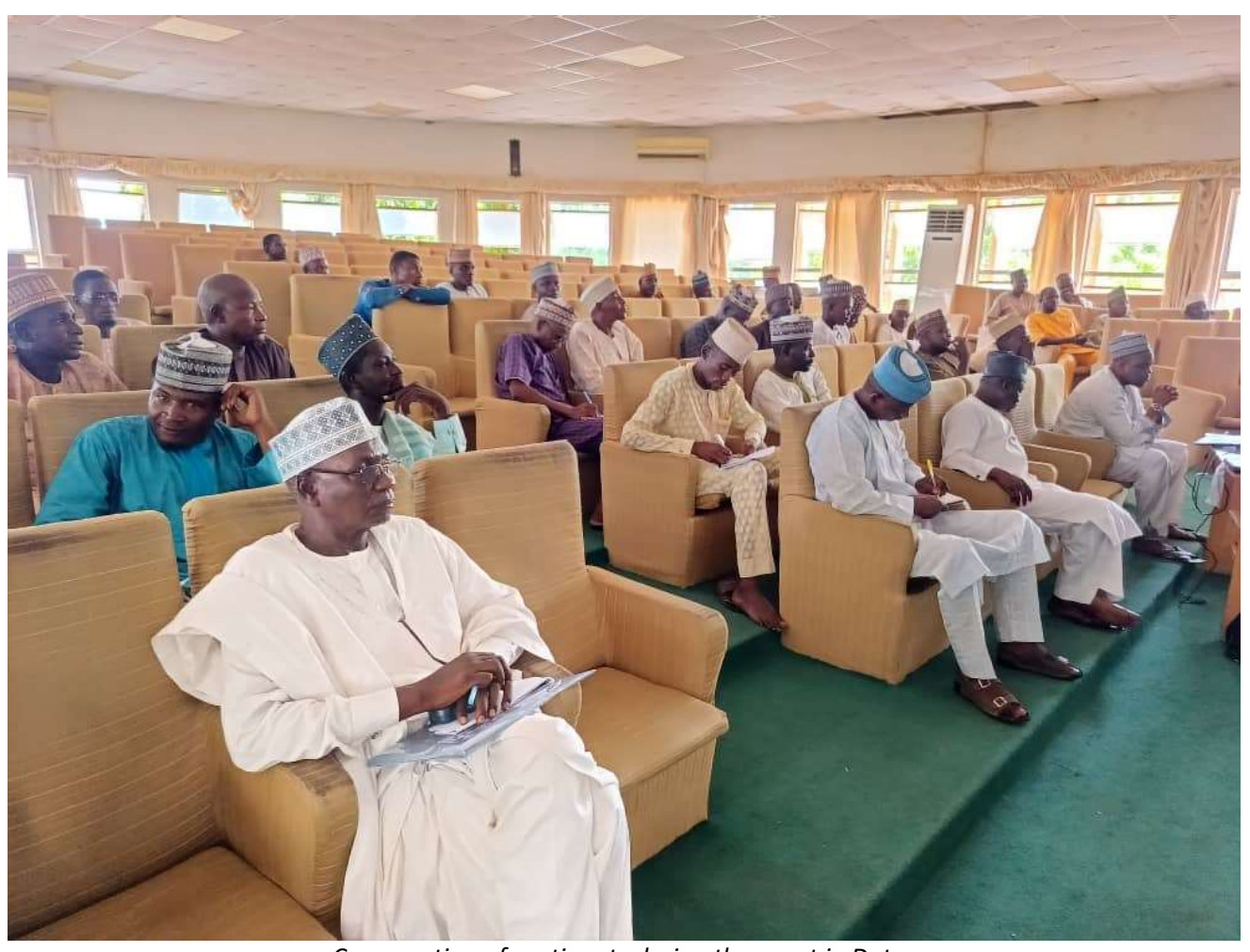
Cross section of partipants during the event in Dutse