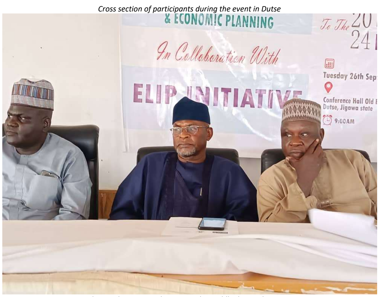
SA on Budget and economic Planning at the Middle during the event in Dutse