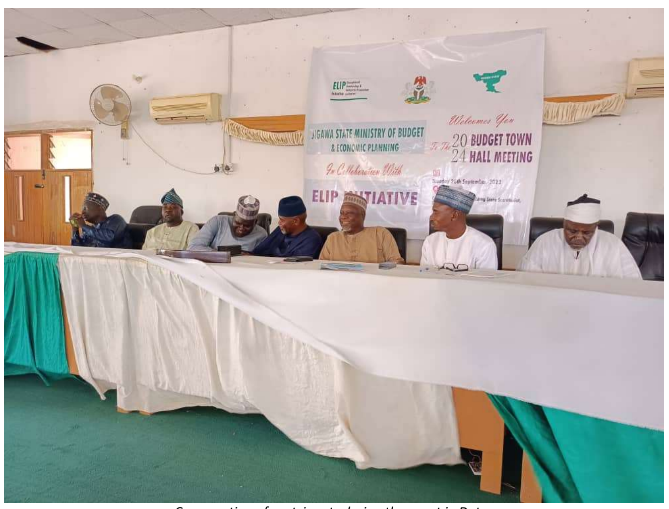
Cross section of partcipants during the event in Dutse