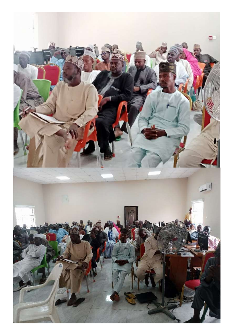
participants during the event in Gumel Zone