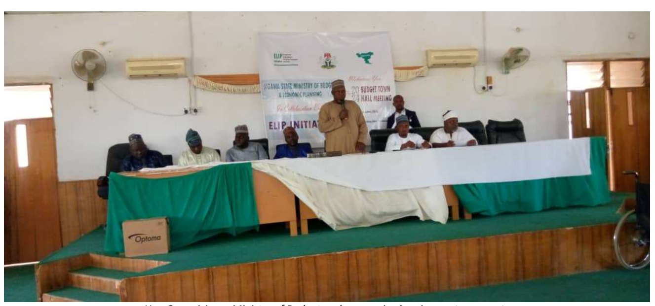
Hon Commisioner Ministry of Budget and economic planning Making remarks