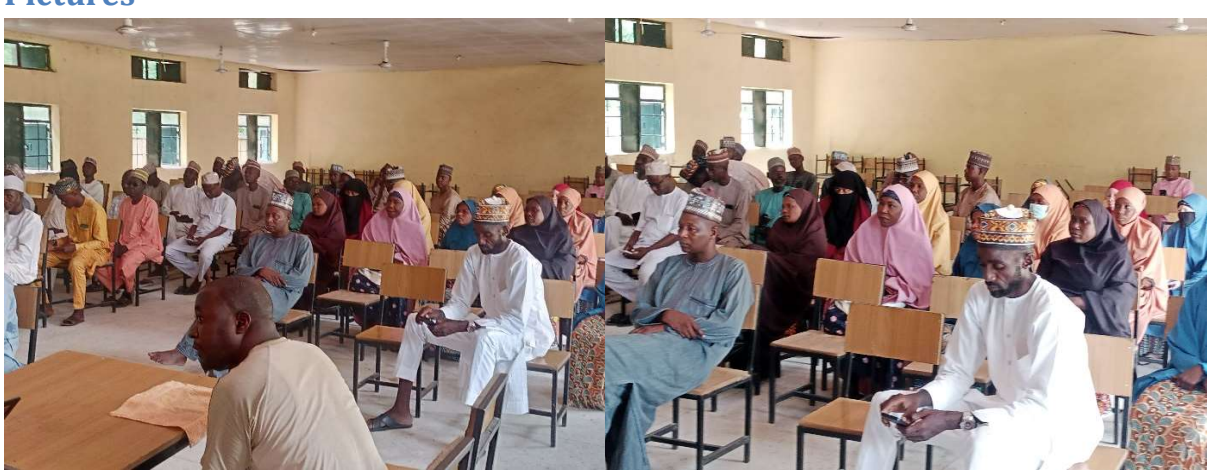
Cross section of the participants at Hadejia Zone